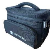
HM-SP01-POUCH M/G/SP Series Pouch